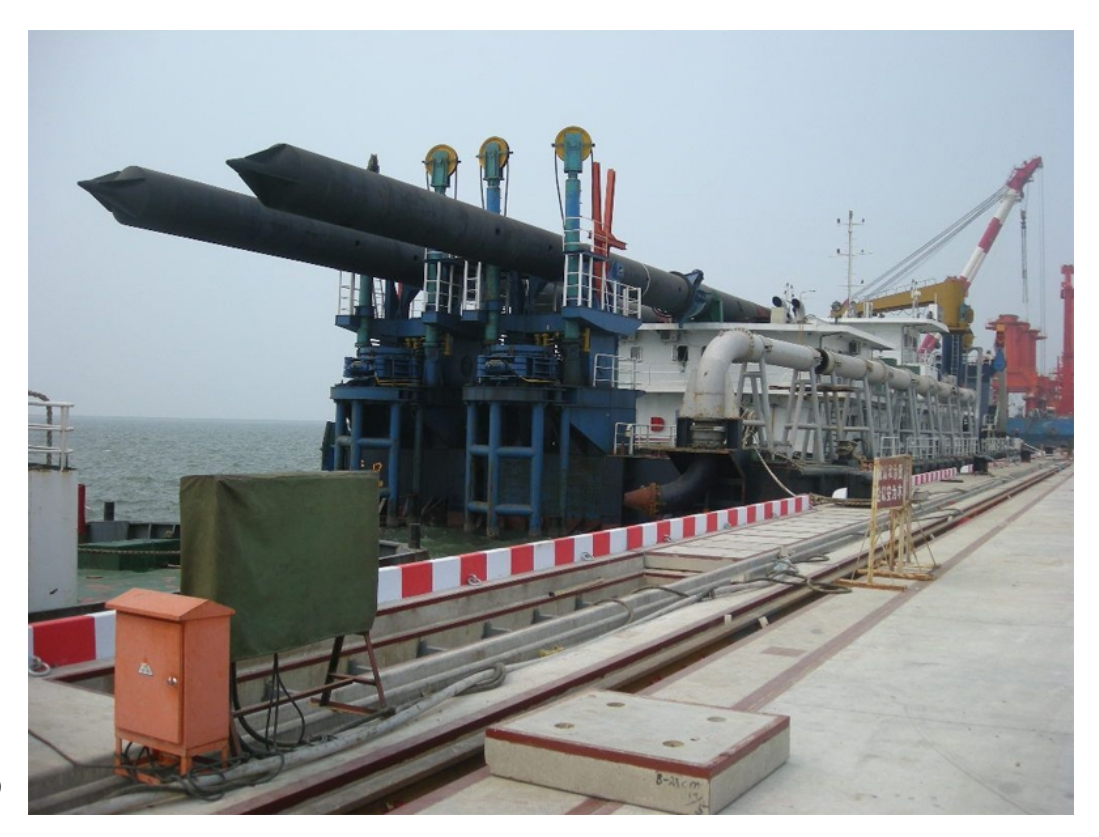
Spud on the CSD