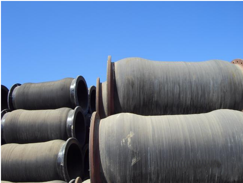
Flange dredging hose in warehouse

Note: Other technical parameter can be made according to the client's requirement.