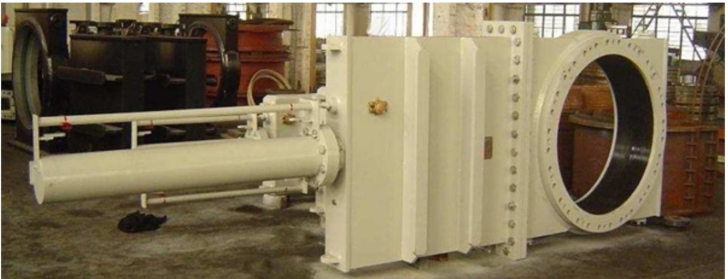
Hydraulically Dredge Gate Valve in factory

NOTE: All dimensions are indicative values only. We can supply the Gate Valves according to your requirements.