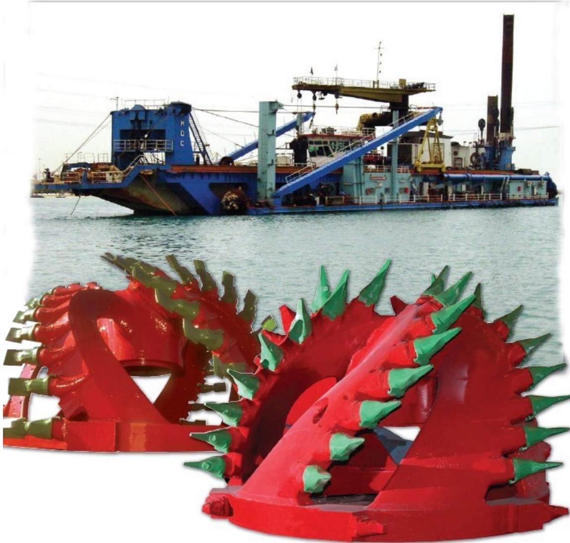
Rock Cutter Head Working Picture