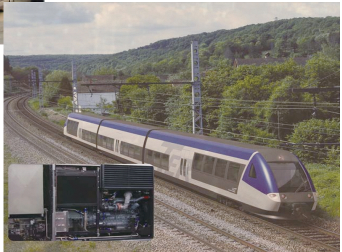
used for high-speed rail

Chongqing Hi-Sea Marine Equipment Import&Export Co.,Ltd.