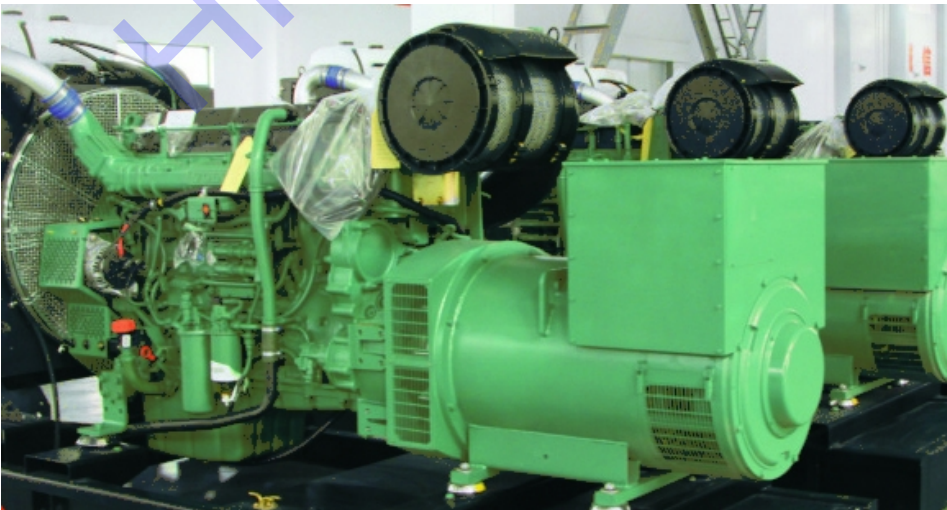
gensets in workshop

VOLVO series environmental protection generator units of its exhaust emission with EURO 2 or EURO 3&EPA standard. It is powered by VOLVO PENTA electronic fuel injection diesel engine that was made by the global-famous Swedish VOLVO PENTA. VOLVO brand is established in 1927. For a long time, its strong brands are associated with its three core values: quality, safety and care for the environment. The VOLVO group subordinate's company VOLVO PENTA is absorbed in the production of industrial diesel engine, industrial vehicles and marine diesel engine products. It keeps ahead in the field of six-cylinders engine and electronic fuel injection technique etc.