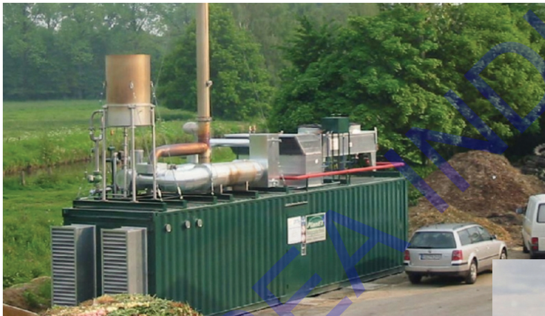
used for engineering