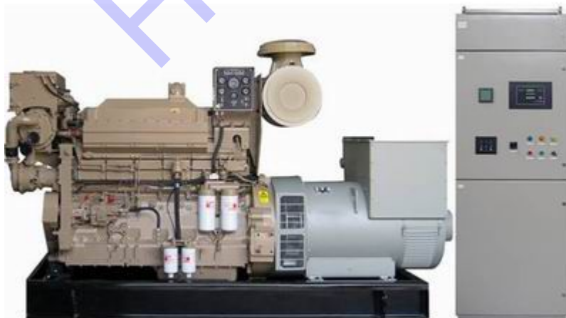
marine Cummins generator