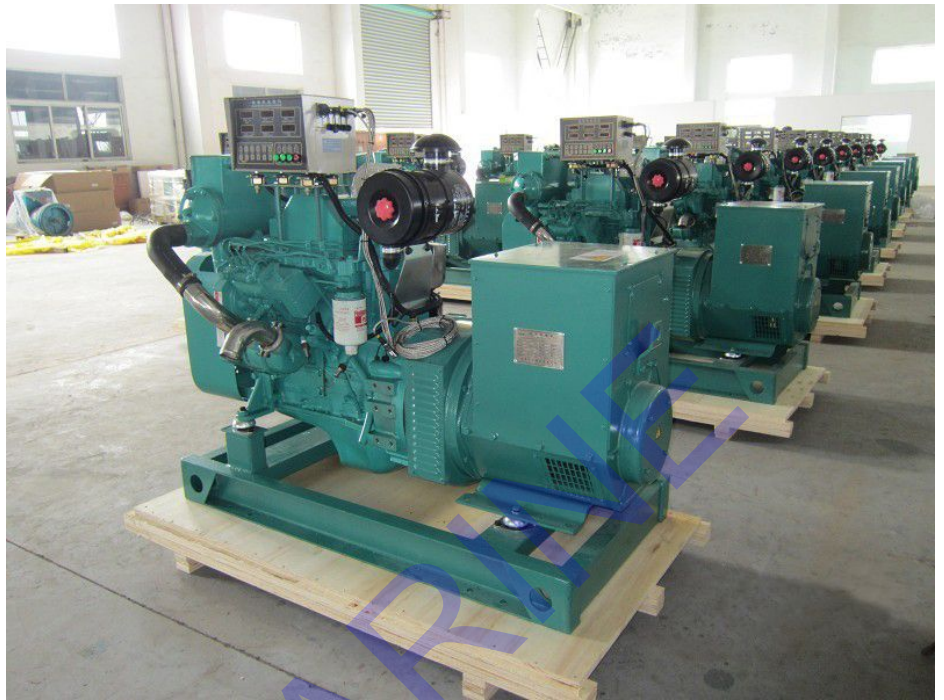
cummins marine gensets in factory