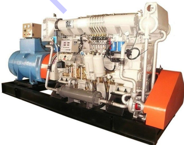
300KW Zichai marine generator