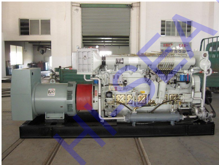
Zichai marine generator