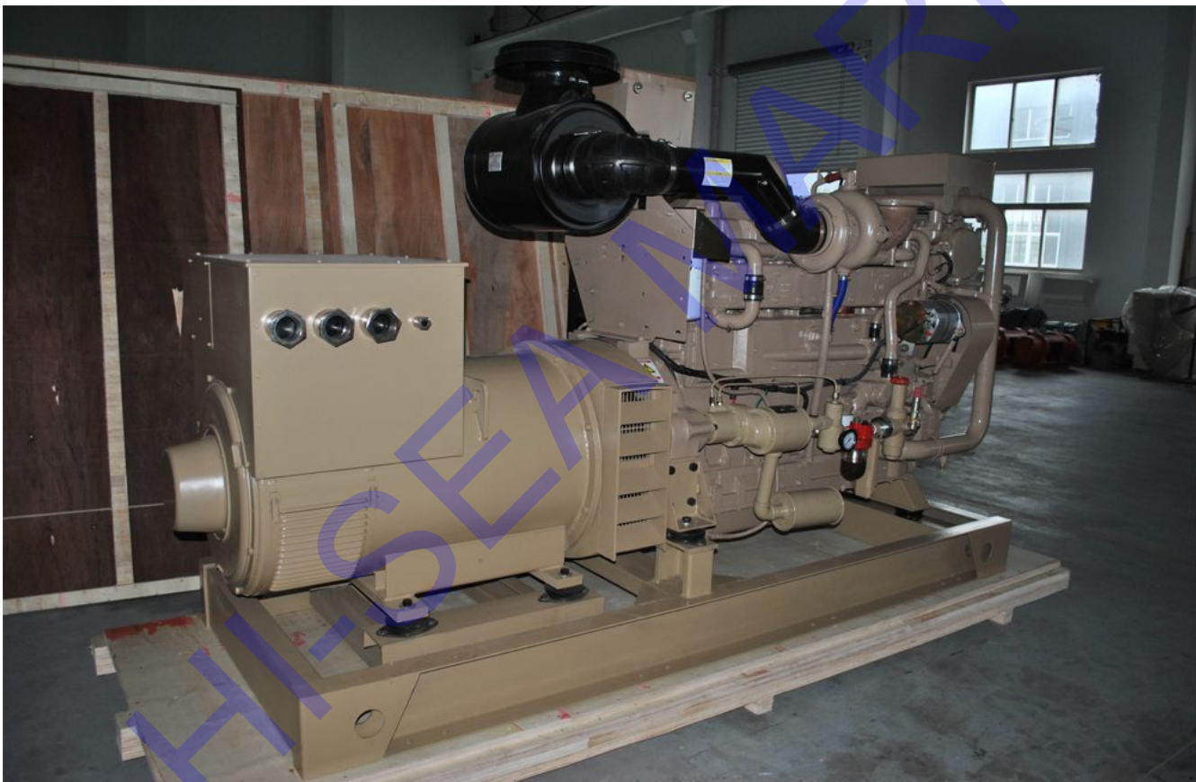
400kw marine diesel generator in factory