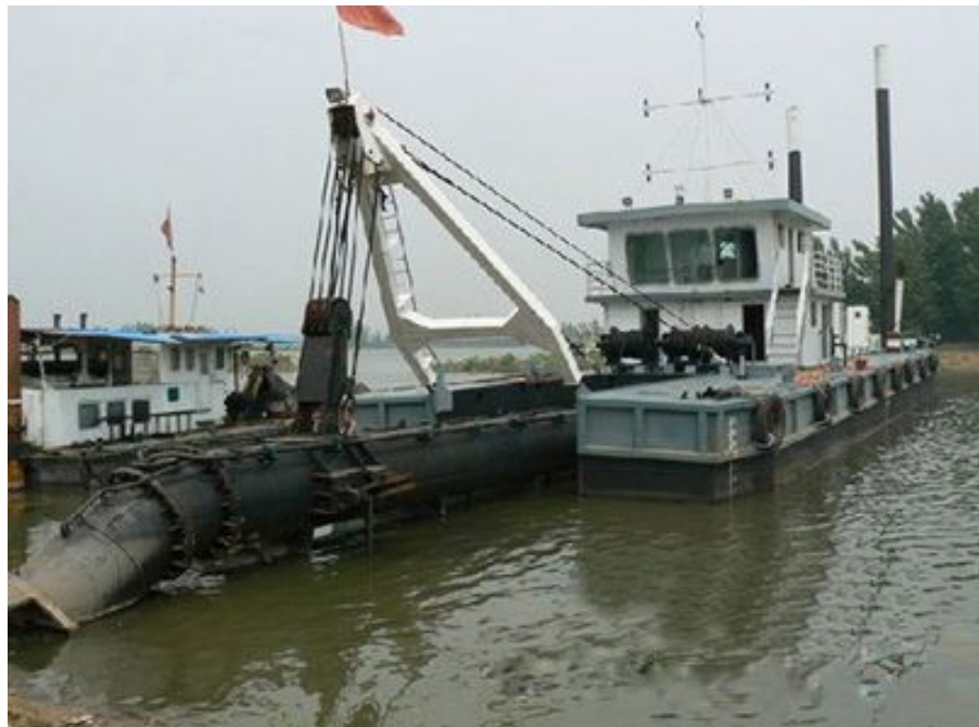
dredging suction head on CSD

Note: According to user's or design and manufacturing drawing.