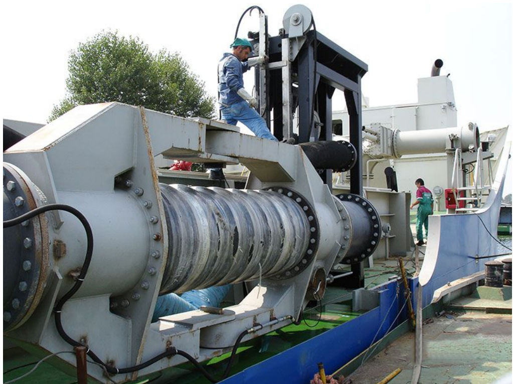
Maintain the Dredging Cardanic Joint

Chongqing Hi-Sea Marine Equipment Import&Export Co.,Ltd.